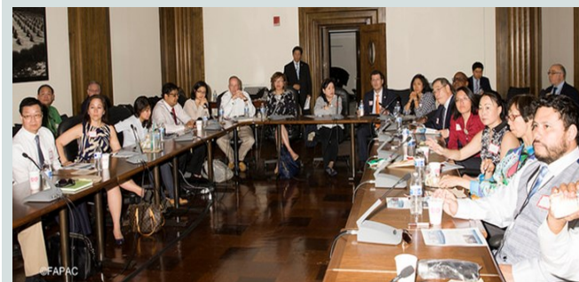
FAPAC Kicks off 2017 CDP at the Department of the Interior Main Building on April 21, 2017.

One of the cornerstones of our organization is career development for federal employees, and the 2017 Career