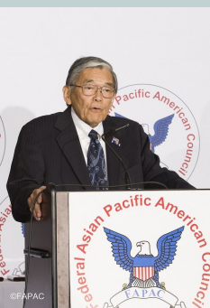
Former Secretary of Commerce and Transportation Norman Y. Mineta gave the Keynote Address at the Civilian Awards Banquet on May 18th.